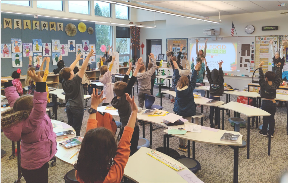
A “Living in Reciprocity” exercise: Breathing With the Trees!

Photos: Bessie Coleman Elementary 2nd & 3rd graders, Corvallis, Feb. 2023